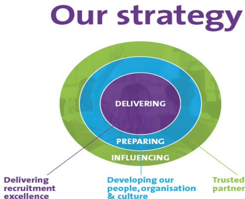
Figure 1: PAS Strategy Map 2020-2023

The PAS strategy for 2020 – 2023 14 is summarised in Figure 1 below.