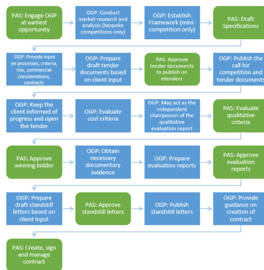
Figure 4: Roles of OGP & PAS in Undertaking Procurement Processes