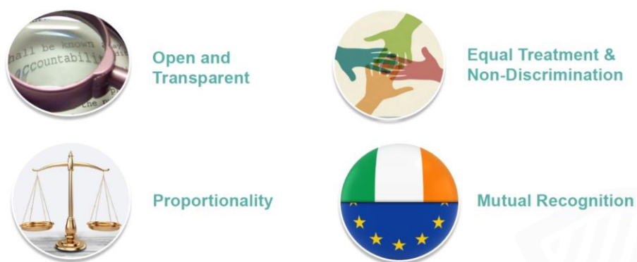
Figure 2: Key Principles of Public Procurement

A competitive process should be carried out in an open, objective and transparent manner that will achieve best value for money. This is in line with EU Directives on public procurement. Essential elements to be observed in conducting the procurement functions include; non-discrimination, equal treatment, transparency, mutual recognition, proportionality, freedom to provide service and freedom of establishment. The Directives impose legal obligations on public bodies when advertising and the use of objective tendering procedures for the award of all tenders.